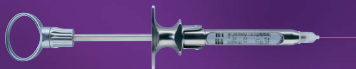
VarioJect made of stainless steel with swing-out technology

In contrast thereto, the swing-out technology permits the cartridge holder to be swung sideways, and only the ampoule itself is replaced.